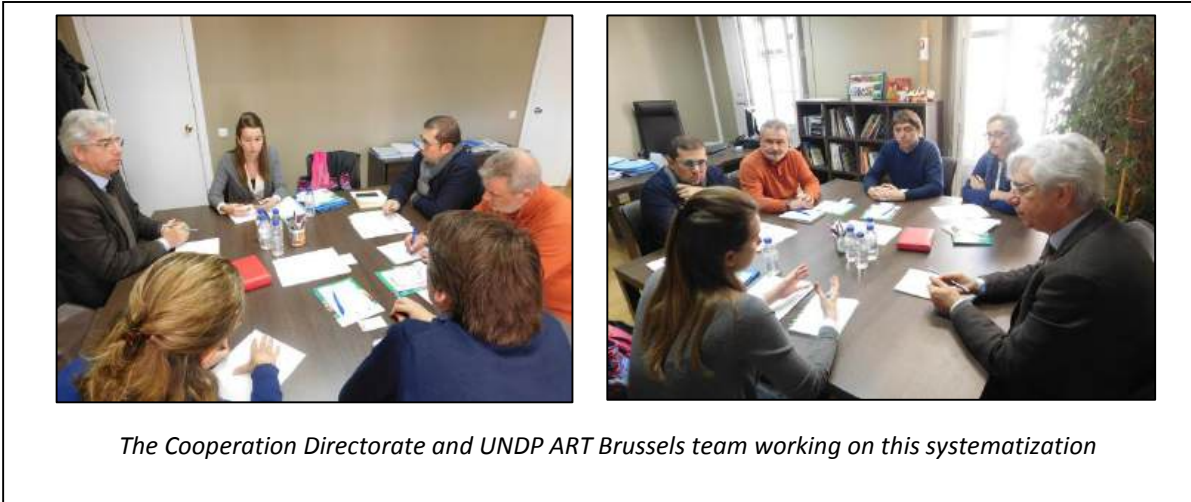
The Cooperation Directorate and UNDP ART Brussels team working on this systematization