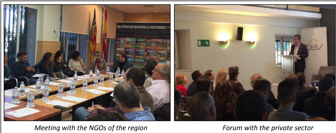
Meeting with the NGOs of the region