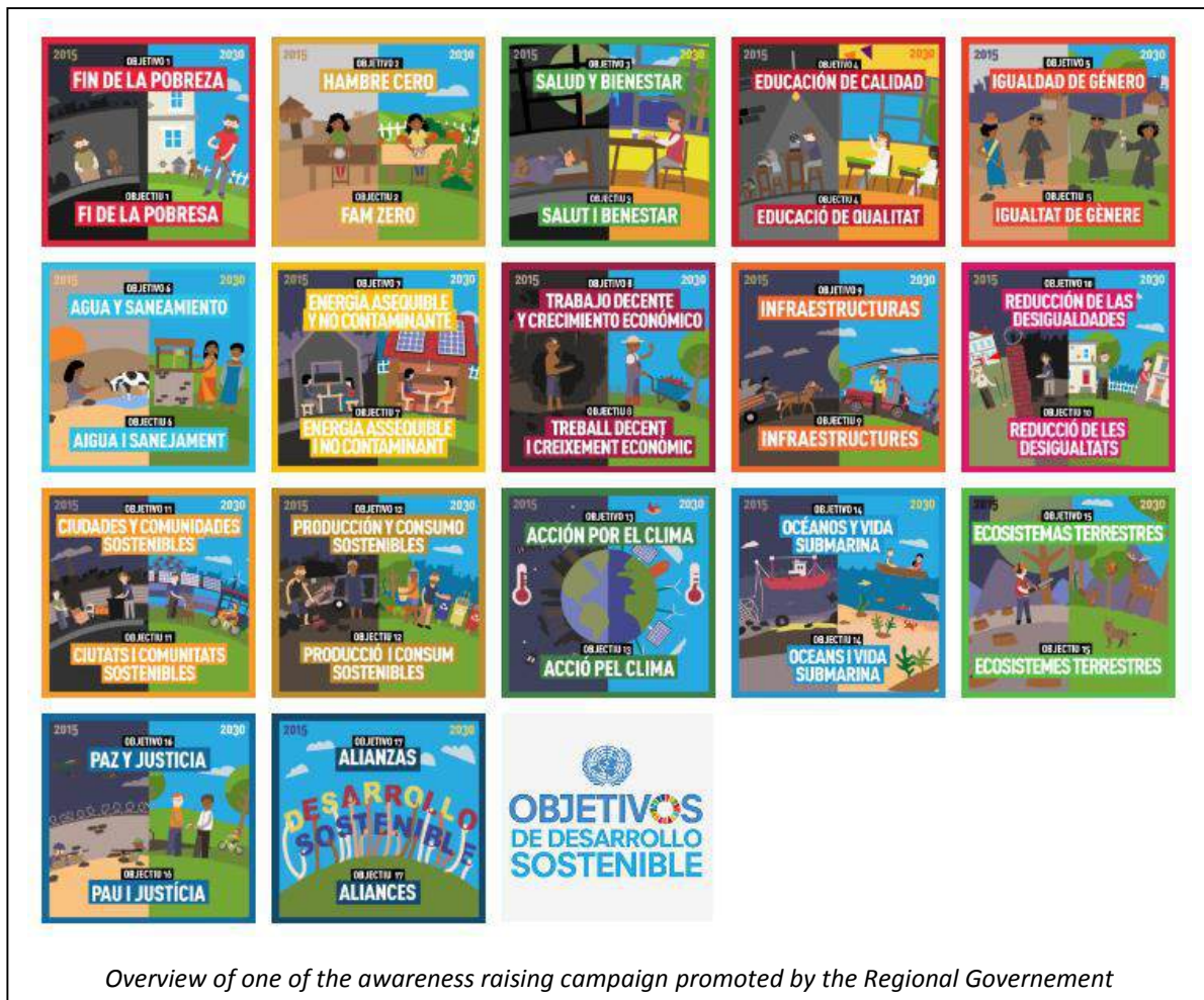
Overview of one of the awareness raising campaign promoted by the Regional Government