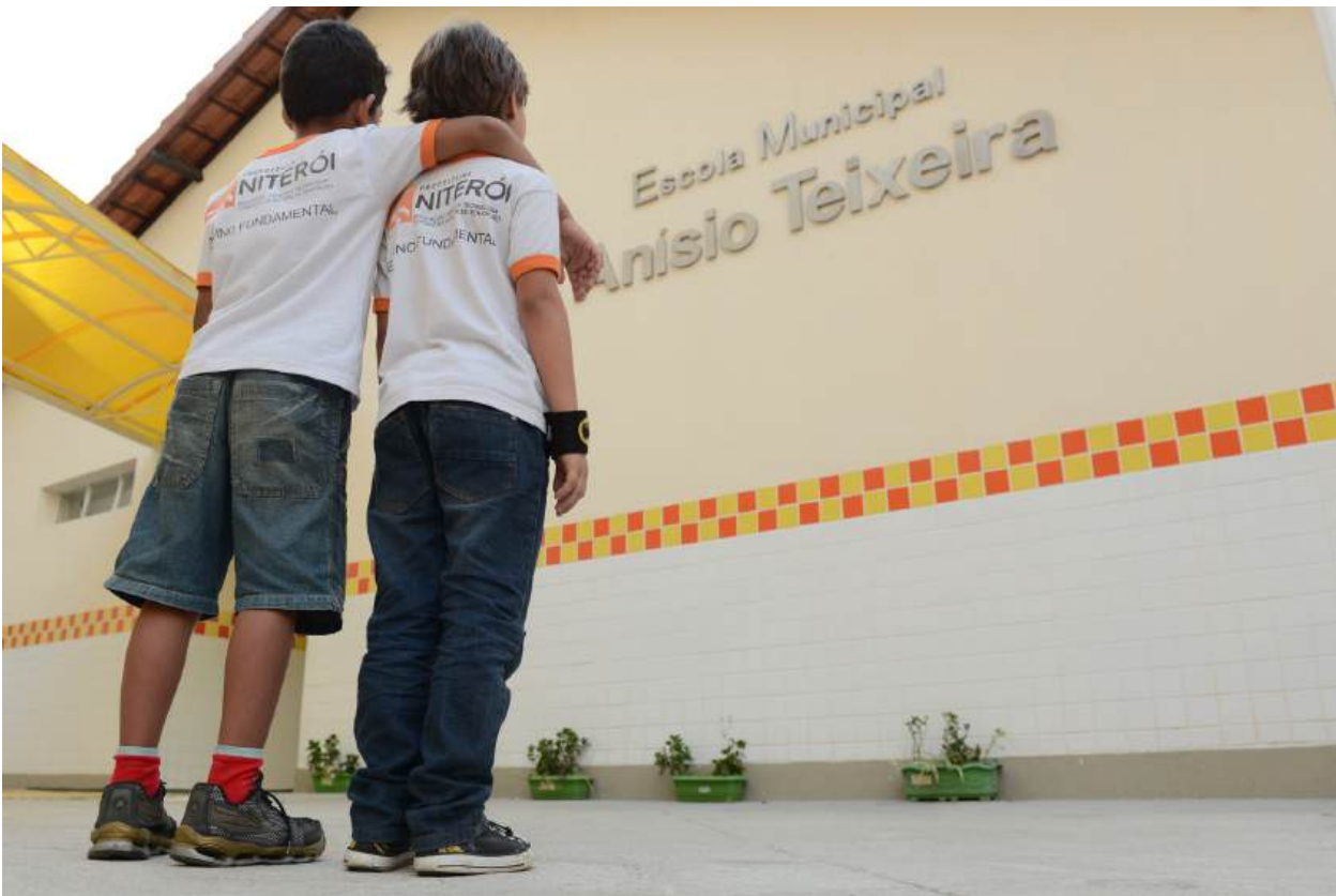
Students at Municipal School Anísio Teixeira.