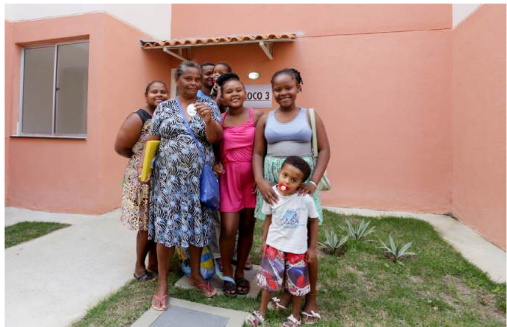
Housing units delivery in Caramujo.

In addition to the achievements in the housing area, the new Municipal Master Plan, approved in 2019, has approved of a new legal framework focused on the right to the city and the fulfilment of a property's social function. There is now the challenge of concluding the ongoing processes and applying the urbanistic instruments to the territory, so that the city can reverse the historical process of socio-territorial segregation that has characterized the urban development of Niterói and most Brazilian cities.