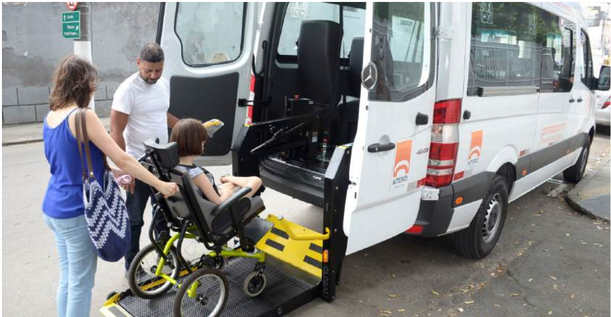
Programme Point to Point.