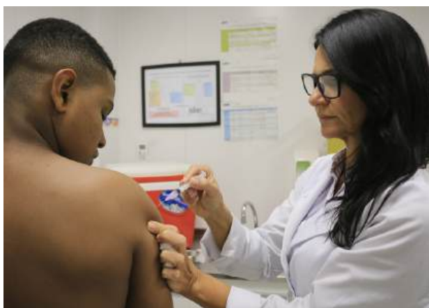
Basic Health Unit vaccination campaign.