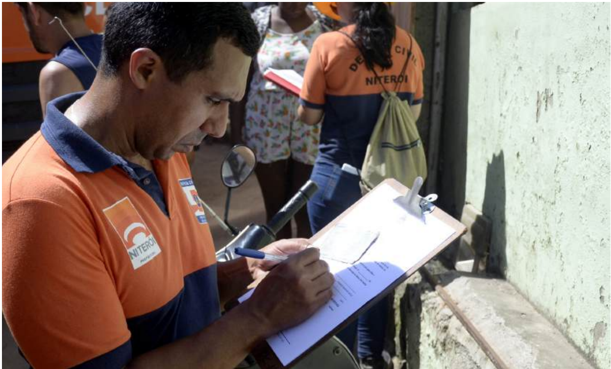
Civil Defense action for risk reductions.