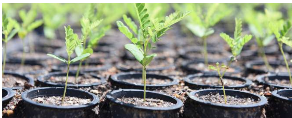
Seedlings for planting – Programme Niterói Mais Verde (Greener Niterói).