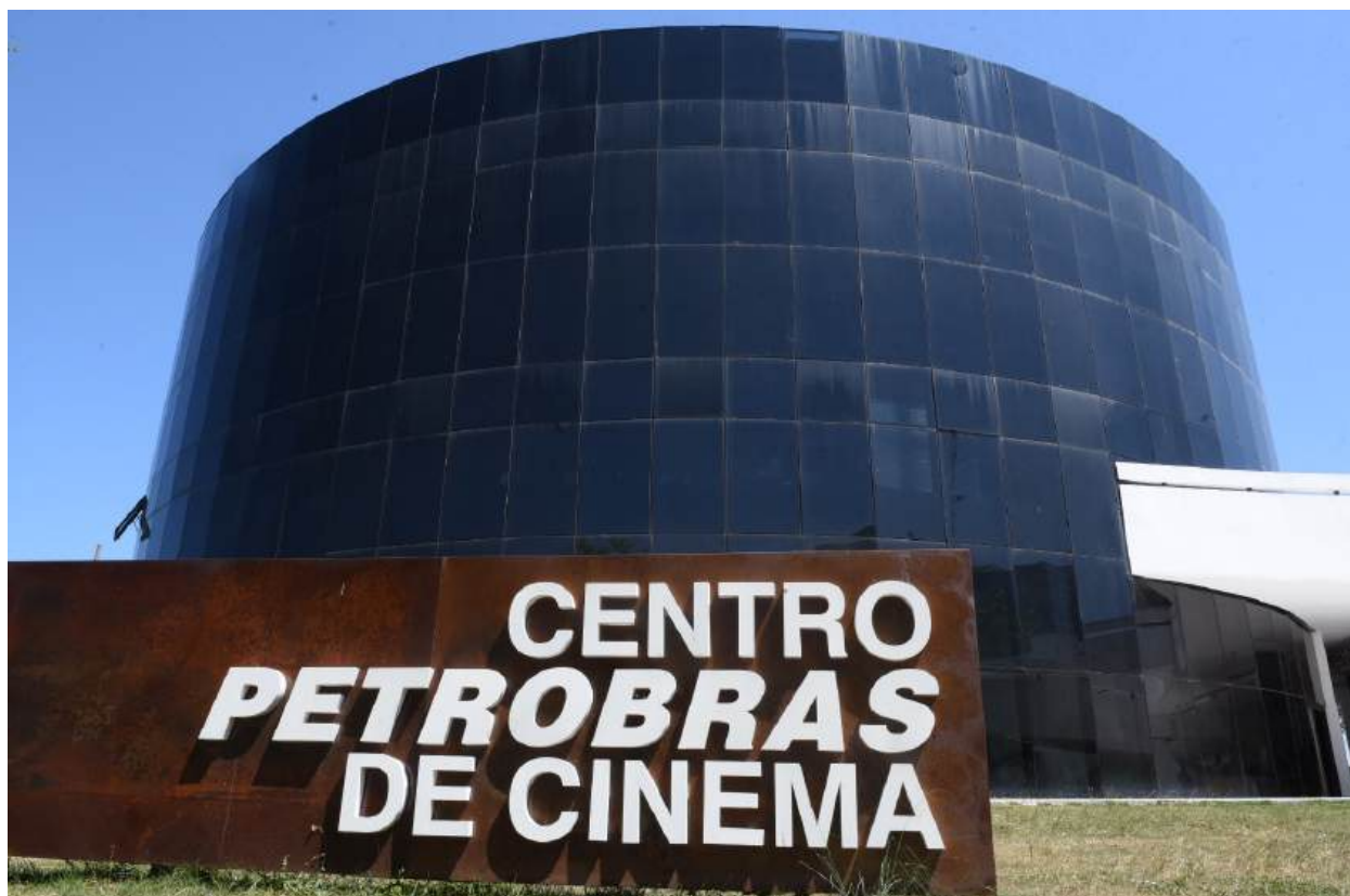
Cinema Centre Petrobrás.

The agreement with UNESCO, entitled 'Promotion of the sustainable development of the material and immaterial heritage in Niterói, was initiated in 2019 and is expected to last for three years. The agreement acts on three main axes (i) tangible and intangible cultural heritage; (ii) artistic and cultural production, creative economy and artistic and cultural rights; (iii) training, qualification and education, and will direct R$ 8.5 million to respond to the fulfilment of the SDGs in joint action by the secretariats of culture, education and tourism. The agreement foresees, among other things, the recognition of works by architect Oscar Niemeyer in the municipality as cultural heritage by UNESCO.