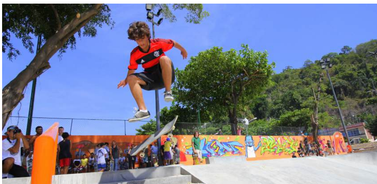
Skatepark Carlos Alberto Parizzi.

More than 150 leisure and living areas have been implemented and revitalized since 2013, such as Horto da Fonseca, Praça Dom Navarro, Praça Boa Vista, and Horto do Barreto, many of them through the Present City Government program. In 2017, the