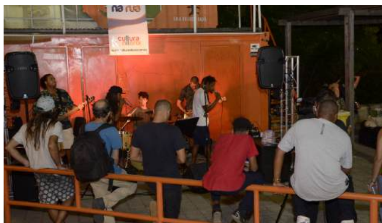
Workshop of Programme Arte na Rua (Art on the Street).

Through the Decree 12903/2018, the Niterói City Government instituted the installation and the use of temporary extensions of public sidewalks by the parklets 18 , with the objective of increasing the pedestrian flow, improving the safety of the sidewalks