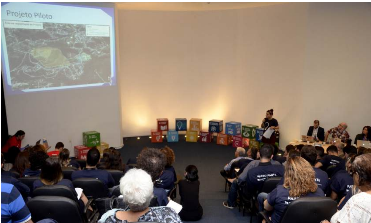
Project presentation at SDG Week by municipal civil servant.

up-to-date is a central theme. WeGov, the public sector innovation start-up, highlights that the skills needed for innovation are curiosity, insurgency, data literacy, storytelling, user focus and interaction 4 .