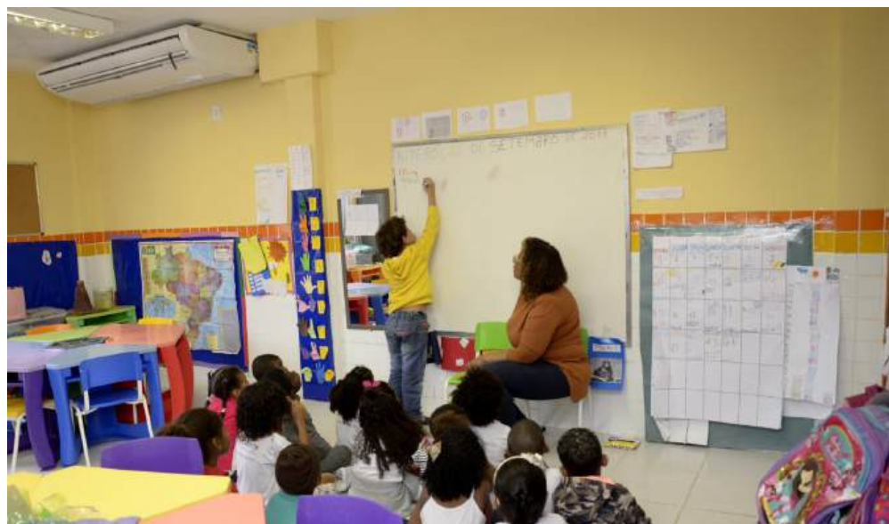
Air-conditioned Municipal School Professora Regina Leite Garcia.

Between the years 2014 and 2019, 6,167 students were included in the learning acceleration program.