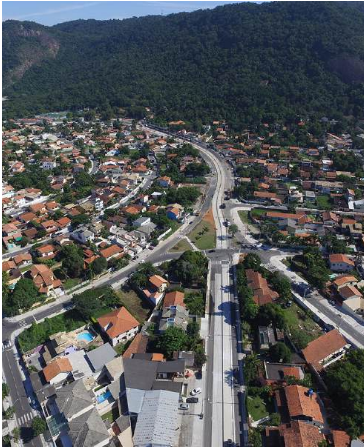
Aerial photo of the construction of Transoceanica.

in Niterói in the road structure that provided more fluidity, comfort and safety to the commuting population, such as the construction of the TransOceânica and the Charitas-Cafubá tunnel in Serra do Preventório (detailed below), which allowed faster commuting between the Oceânica Region and the centre of Niterói; the Renascença Square tunnel located in downtown, which aimed to relieve the traffic of public transport from the João Goulart Terminal, and the development of the expansion, re-urbanization and widening of Marquês do Paraná Avenue, an important route that connects the downtown area to the South Zone of Niterói.