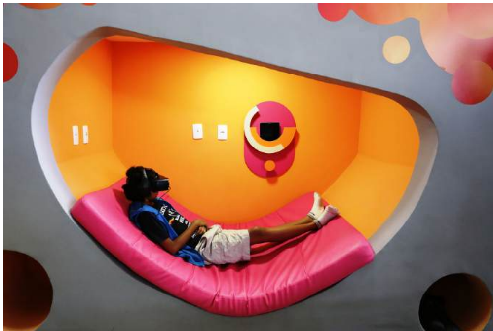
Virtual reality activity on the Engenhoca Platform.