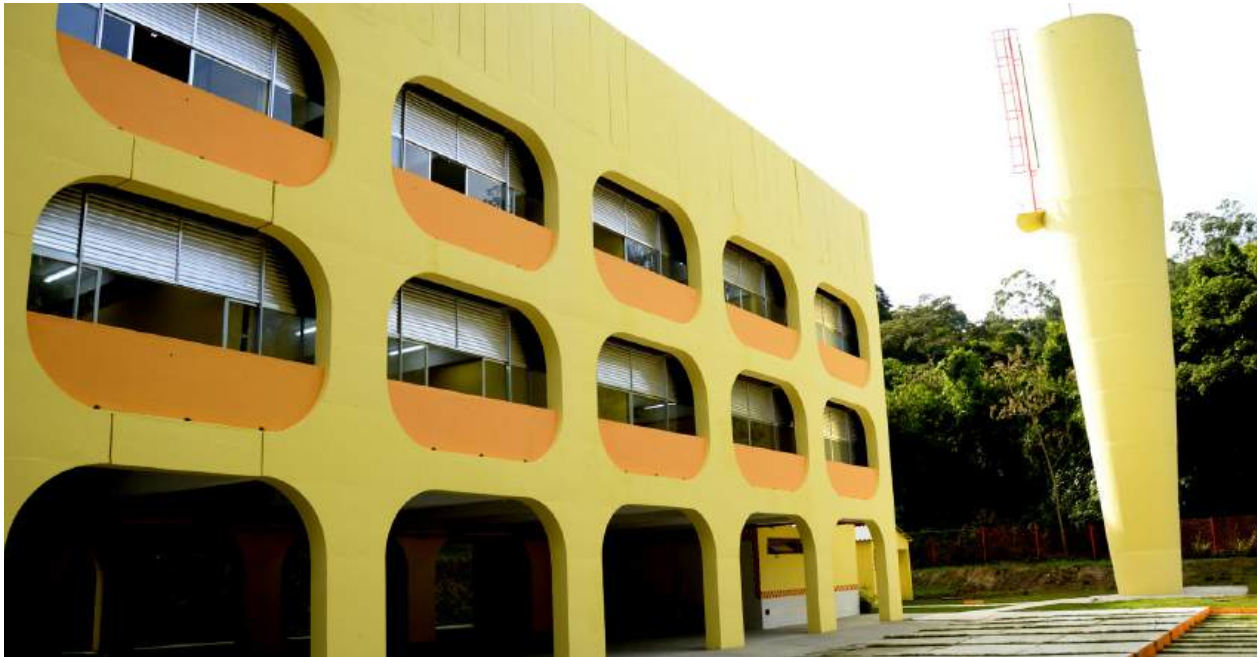
CIEP Esther Botelho Orestes refurbished.