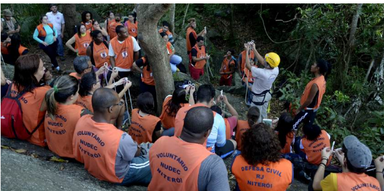
Training of Community Civil Defence Units (NUDECs).

By 2020, 2300 volunteers have undergone a training process that includes first aid and domestic accidents to learn how to proceed in case of heavy rains when living in hillside areas and how to guide their neighbours to the perception of geological risks and the warning and alarm system. This represents an advanced extension of civil defence in case of emergencies, acting in different points of the city. For each of the 100 groups created, there is a specific WhatsApp group that follows the demands of the community every day and informs them about the