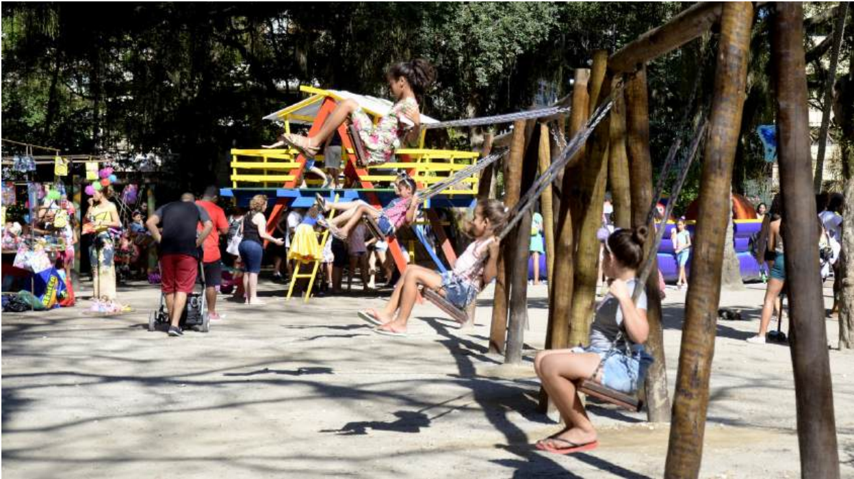
Children's Day at Campo de São Bento.