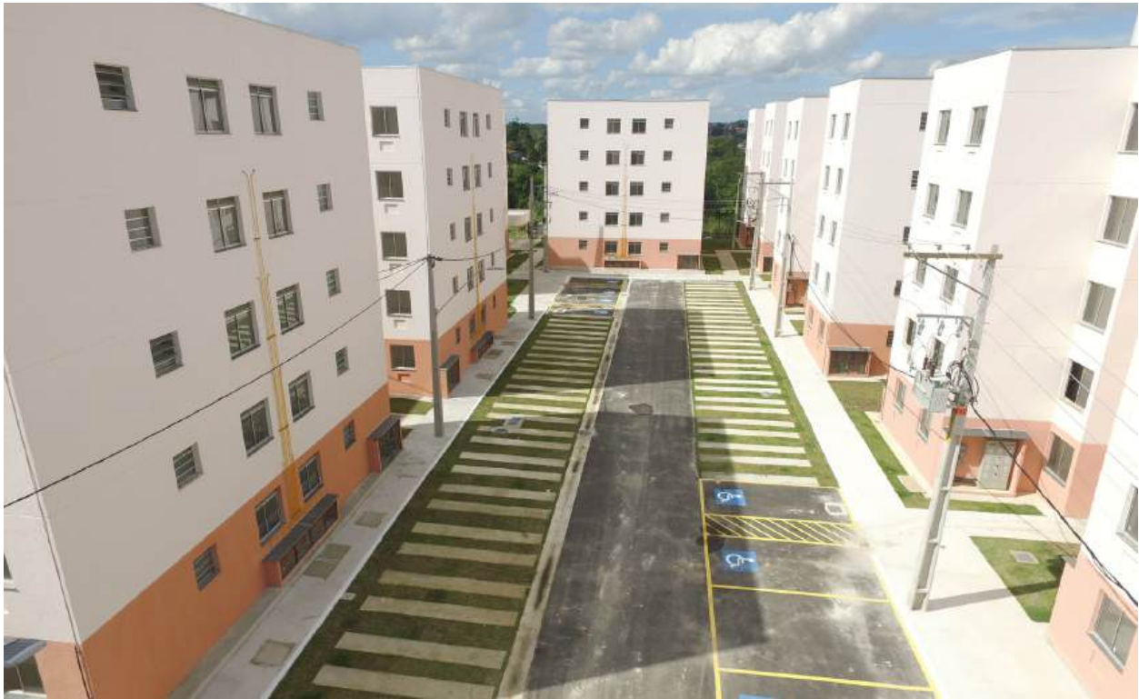
New housing units built.

has been carried out for the elaboration of projects of Technical Assistance in Housing of Social Interest - ATHIS.