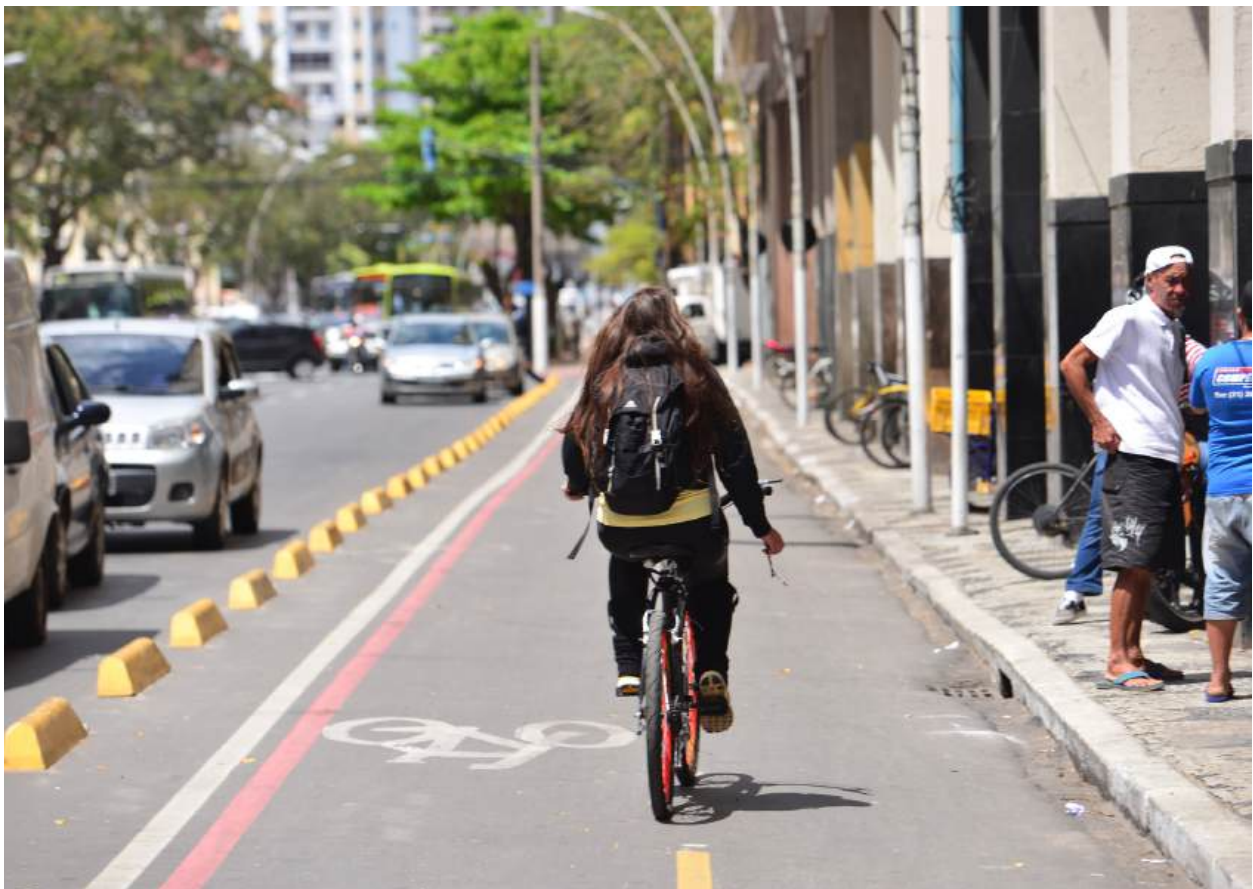
Ernani do Amaral Peixoto Avenue Bicycle path.

However, the city has made important achievements in recent years from the point of view of strategic project execution and planning. Infrastructure projects essential for improving the efficiency of public transport and the bicycle path system have been implemented, as well as solid participatory processes that culminated in the preparation of structural plans for the development of mobility policies (approval of the Master Plan in 2019 and the development of the Municipal Sustainable Mobility Plan).