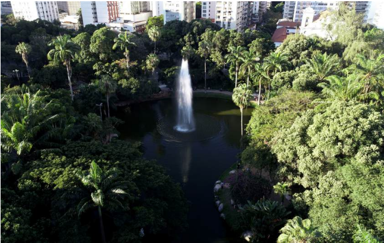
Aerial photo of Campo de São Bento.

Parque das Águas was reopened, and since 2018 new squares have been built in the districts of Fátima, Fonseca, Boa Viagem and Piratininga and revitalizations in Icaraí and Ponta D'Areia. Two Skateparks have also been implemented, one of them with the third largest track in Brazil. Currently, the JK Square in Cento de Niterói, designed by architect Oscar Niemeyer, is being revitalized by the city government.