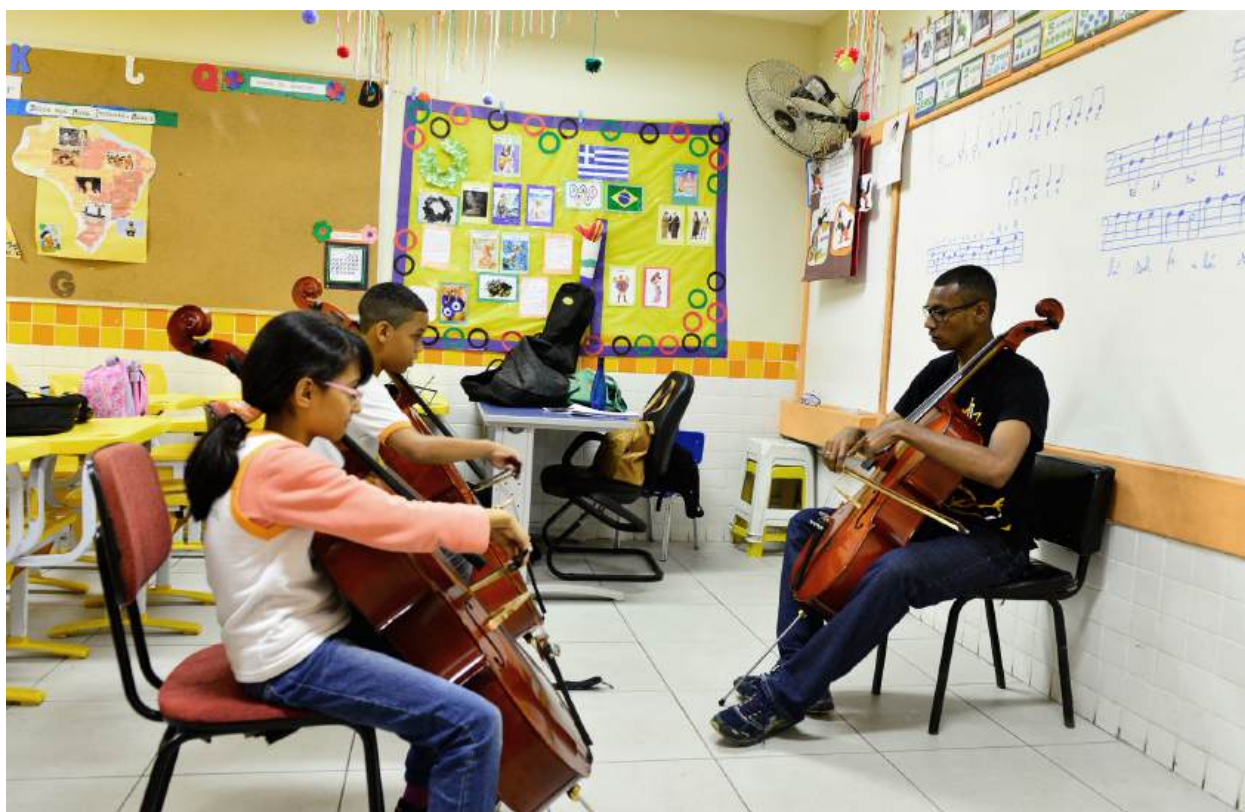
Programa Aprendiz – Music at School.

The Apprentice program is a public musical education program for children and teenagers, the result of a cooperation