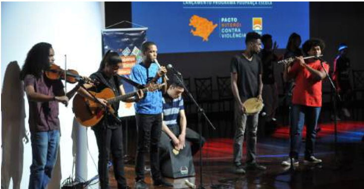
Launching of Programme Poupança Escola (School Savings).

Students from the municipal, state or federal public network of Niterói who are attending the 9th grade of elementary school or any of the grades of regular high school or integrated vocational education are included in the program. In 2019, in its 1st phase, the program reached 150 students. The goal is to reach 400 students in 2020 and 2,000 students in 2021.