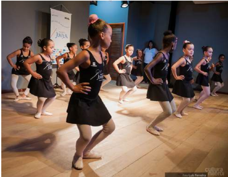
Class at City Ballet Company.

will be restored on four beaches. In Morro da Viração, besides the restoration of 86 hectares of dense ombrophiles vegetation, the management and harvest of an old eucalyptus plantation will be adopted, with subsequent restoration of the area through palm heart trees and the reintroduction of the Juçara palm tree, native to the Atlantic Forest, which feeds 70% of the local marine fauna. The project foresees the purchase of seeds from traditional communities and family farms to strengthen the local productive chain and social inclusion by hiring traditional communities as labour for the planting.