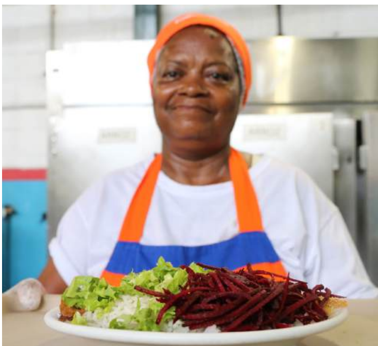
Meal served at the Popular Restaurant Citizen Jorge Amado.