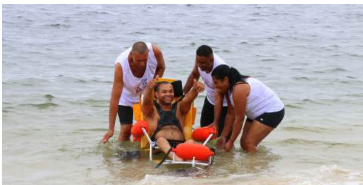
Project Beach without Barrier.