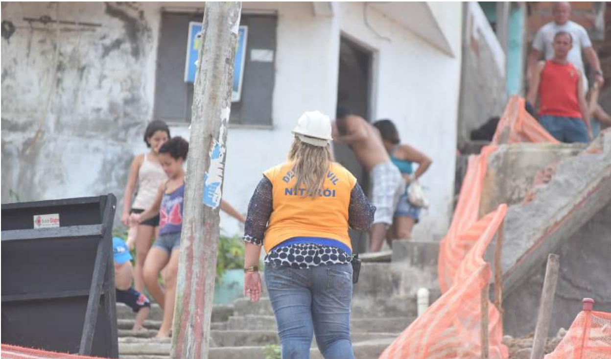
Civil Defense Action to implement the Most Resilient Niterói Plan.

the condominiums. Occurrences such as cracks, fissures due to inadequate works, fires, gas leaks and strong winds are being identified in an initial project involving 36 city landlords, in residential condominiums, horizontal and vertical, of all income levels, for a Civil defence action program. There is a group created for communication with each condominium in order to create a system to prevent and combat risks, managed by the meteorological service.