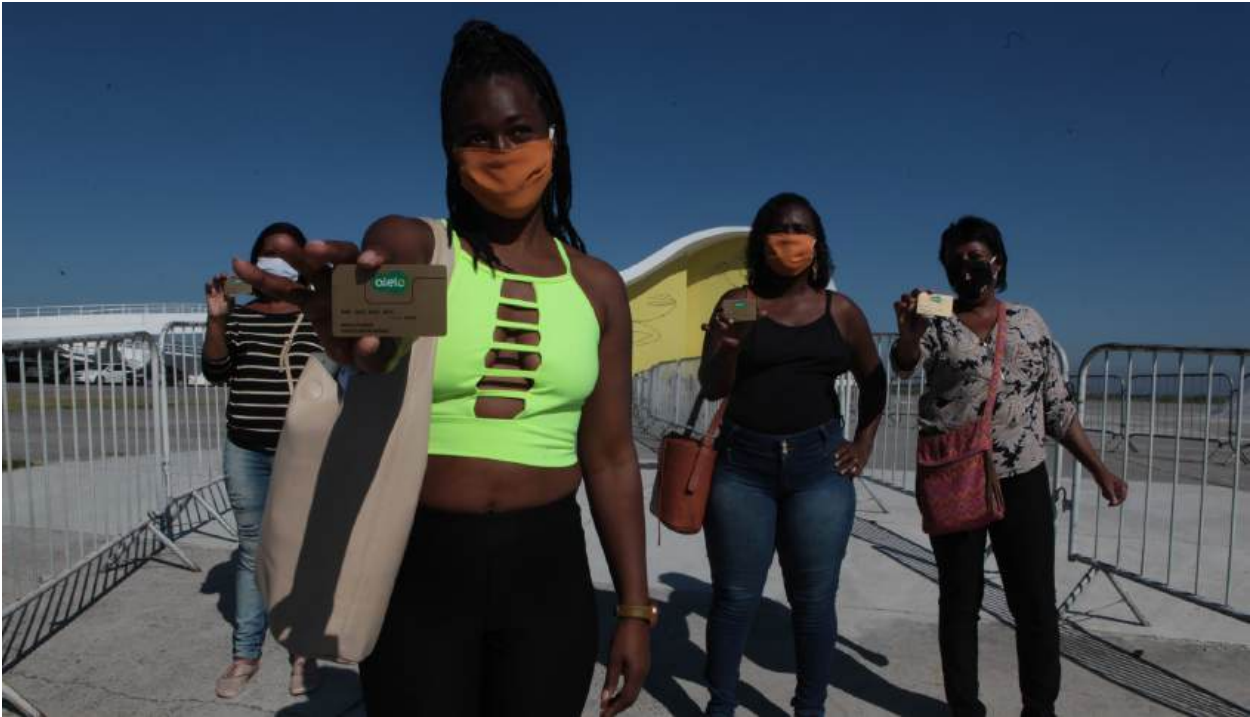
Citizens receive social card for assistance from the Basic Income program.