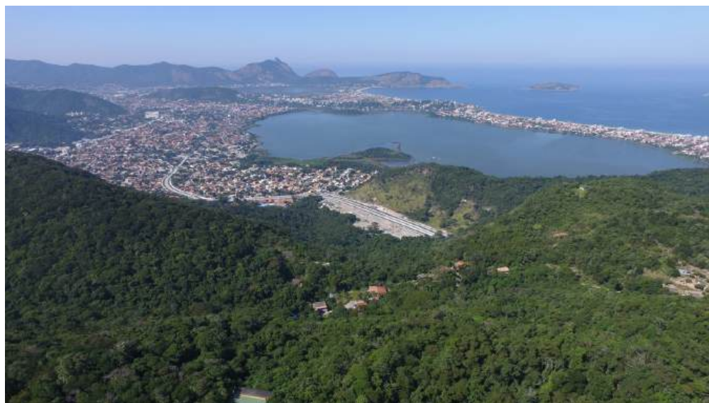
Itaipu-Piratininga Lake (PRO-Sustentável).

In 2017, the Municipal Department of Environment, Water Resources and Sustainability of Niterói (SMARHS) started a project for the restoration of 203 hectares of local Atlantic Forest through financing R$ 2.836 million with non-refundable resources from the BNDES Social Fund. The project includes the restoration of 31 hectares of vegetation on four islands in the municipality and 65 hectares of mangrove forest around the Itaipu Lagoon. In the Permanent Preservation Area (APP), for which responsibility is shared between the city and the Union, 21 hectares of restinga vegetation