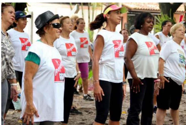
Elderly at class of Project Gugu.