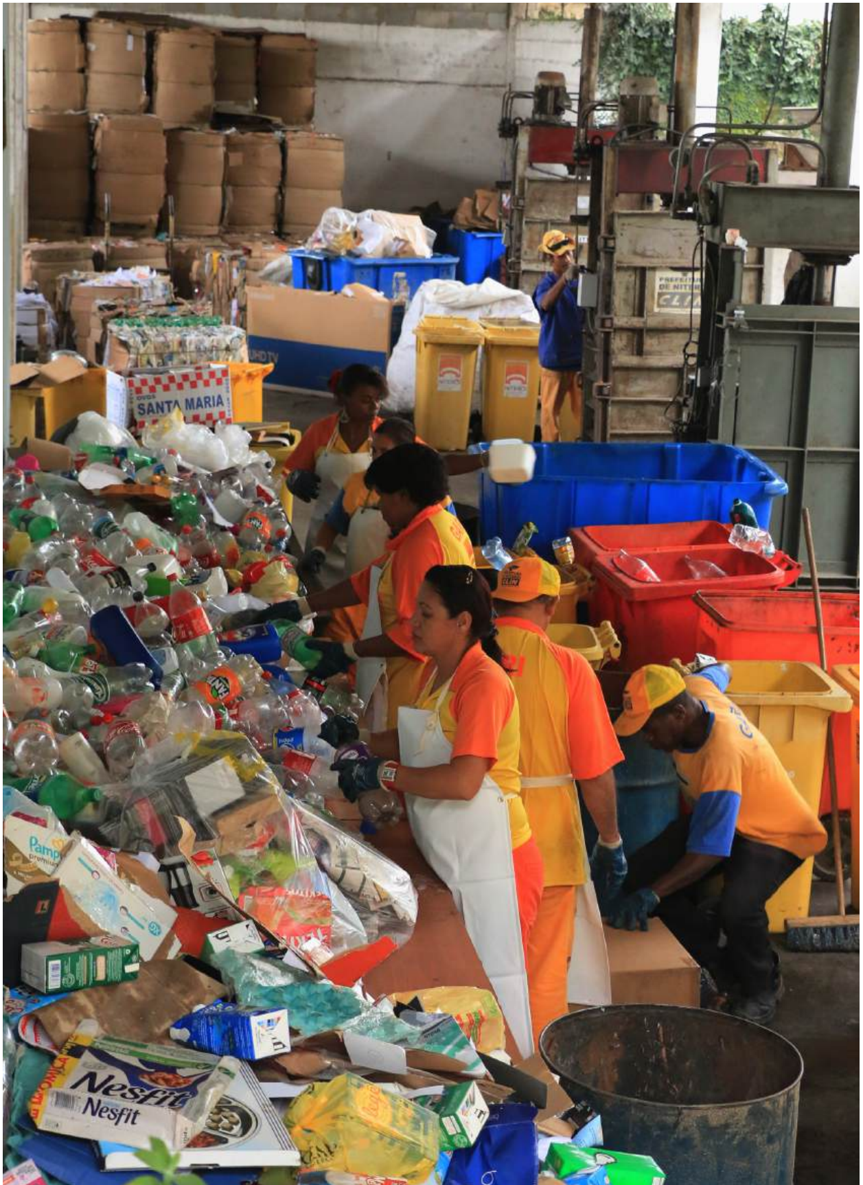
Niterói Cleaning Company's performance (CLIN) on Recycling Programme.