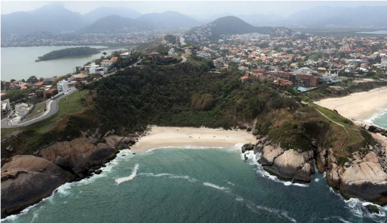
Aerial photo of the Municipality of Niterói.

Plan 3 , which emphasizes the participation of society in planning the next 20 years and the preparation of the city for current and future challenges. Part of the Plan is the formulation of the Commitment to the Results Program, which promotes, through indicators, an organizational adherence to short, medium- and long-term instruments that strengthen the municipality's capacity to monitor, evaluate and improve its public policies through seven result areas :