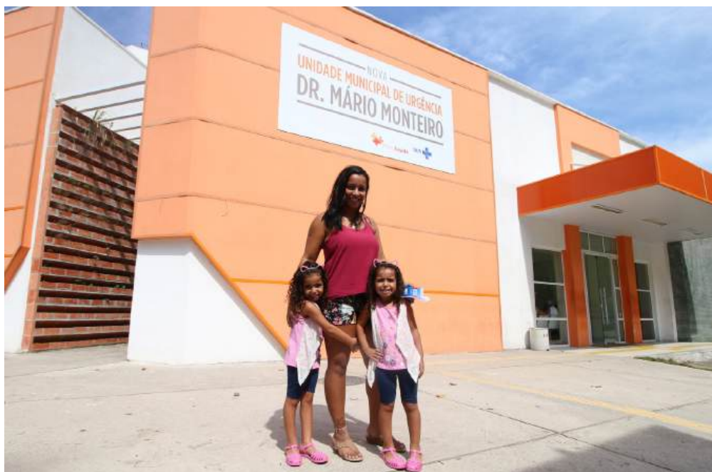
New Municipal Emergency Unit Dr. Mário Monteiro.

The project proposes an innovative approach to reduce the transmission of Dengue, Zika and Chikungunya viruses by releasing the Aedes aegypti mosquito with the Wolbachia bacteria. The project is part of an international initiative, the non-profit program Eliminate Dengue: Our Challenge, which is conducted in Brazil by the Oswaldo Cruz Foundation (Fiocruz) and has 4 main activities: communication of the project; community engagement; release of the Aedes aegypti mosquito with Wolbachia; and monitoring, to verify the presence of