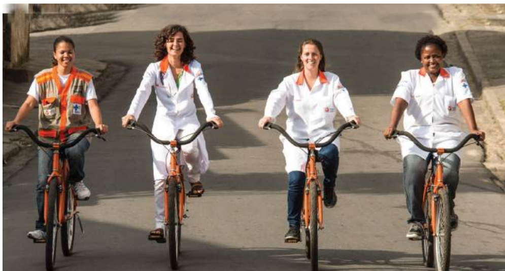
Professionals of the Family Medical Program.

It is also worth mentioning the management's effort to invest in strategic focuses such as the Family Medical Program, basic health care and management without outsourcing, as well as promising actions in the area of sanitation (described in the analysis of SDG 11), which are directly linked to the population's health and involve, above all, investment in Sewage Treatment Plants and the structuring of the Municipal Sanitation Plan.