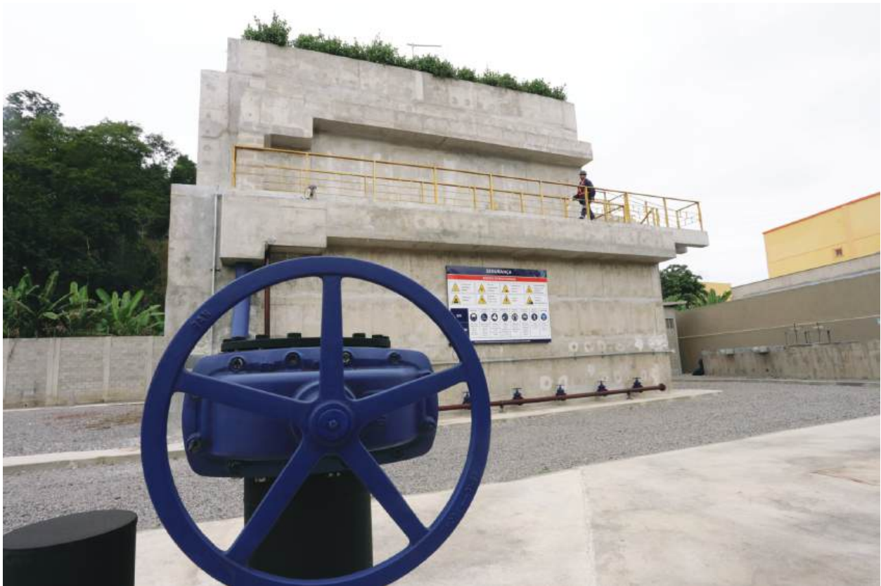
Sewage Treatment Plant (ETE) Maria Paula.