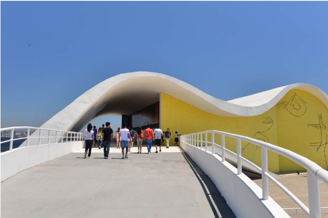
Popular Theatre Oscar Niemeyer.