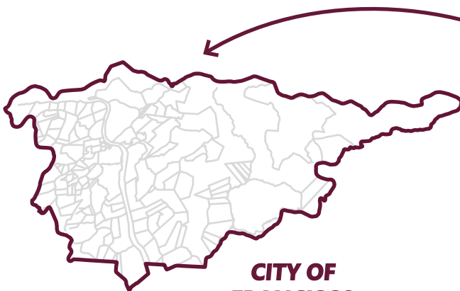
CITY OF FRANCISCO MORATO