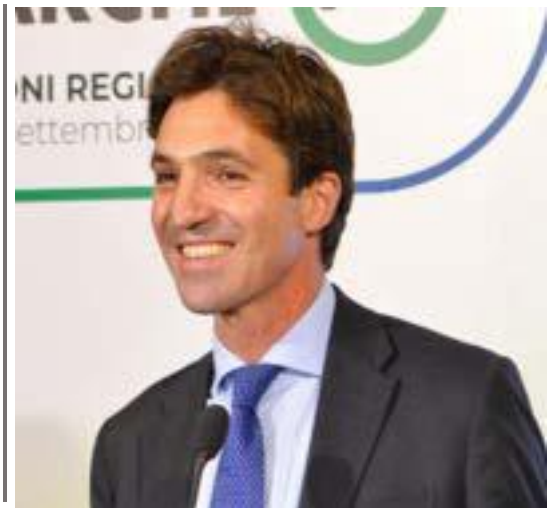
Roberto Morroni , Umbria Region Vice President and Councillor for agricultural and agri-food policies, protection and environmental enhancement

“Sustainability represents a bottom-up process and acts in a transversal way. Several experimentation areas have been activated, starting from our villages, which are places that represent a fundamental heritage of regional identity. On these areas, interventions such as the digital transition, the development of economic activities, the cultural heritage and activities, the active labor policies, the support for business creation and the agricultural and food supply chain promotion converge. The final aim is the social, economic and environmental sustainability.”